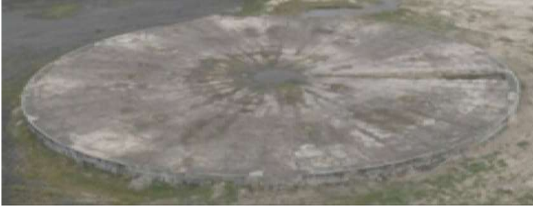
Figure 14. Abandoned tank beam foundation for a major oil and gas company in Nigeria.