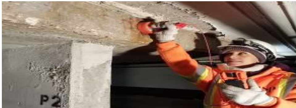
Figure 7. NDT corrosion mapping.

delamination and other discontinuities are identified. The practice has been standardized by ASTM D6087.