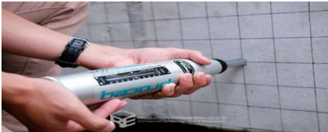
Figure 1. Schmidt rebound hammer.

compared with the relevant acceptance standards. A flaw is deemed defect if it exceeds the acceptance level as presented in the code or standard (Rummel, 2014).