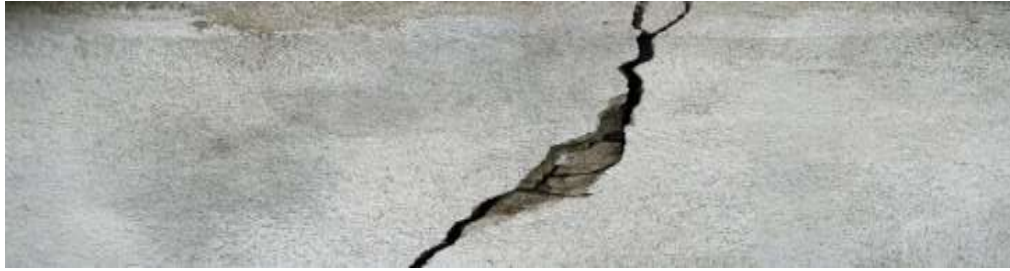
Figure 12. Crack in a concrete foundation.

Source: Adapted from www.giatecscientific.com/education/cracking-in-concrete-procedures .