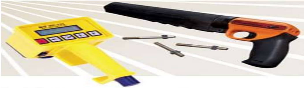
Figure 2. Windsor probe system. Source: Adapted from James Instrument Inc.