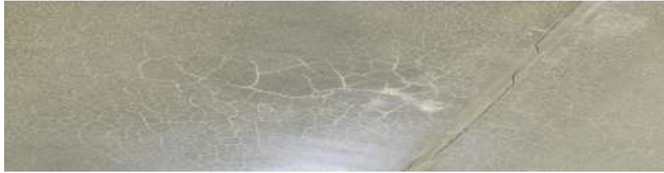
Figure 10. Delaminated concrete. Source: Adapted from concretedecor.net .