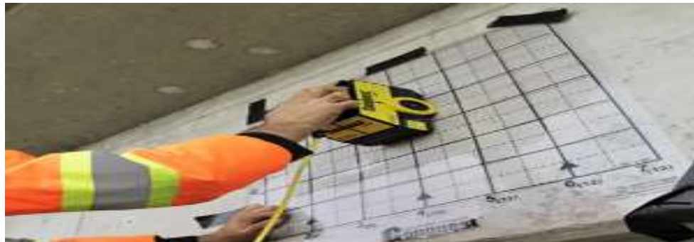
Figure 5. NDT of Concrete using GPR.