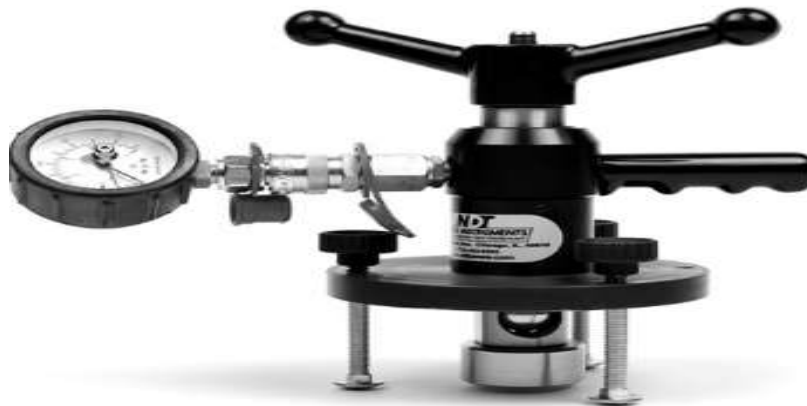
Figure 3. Typical setup for pull-out resistance NDT method.

refers to non-destructive despite the disturbance of the concrete during penetration.