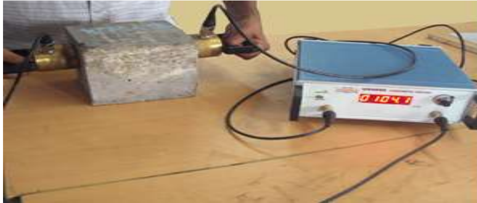
Figure 4. Ultrasonic pulse echo method.