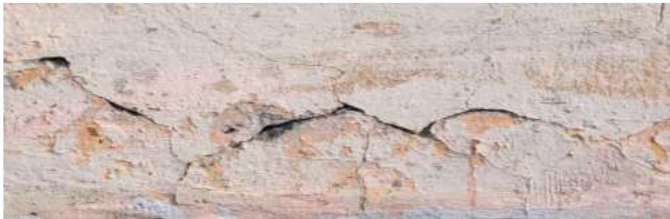
Figure 11. Spalling of concrete.

concrete floor slabs, pavement and beam foundations. It is the detachment of a thin surface layer from the rest of the system (typically 2-8 mm in thickness) and usually manifested by a 'drummy' like-sound. The defect is often caused by trapped air or water content which combines to make larger bubbles during concrete finishing operations thereby causing the separation of the surface from the system. Experience has shown that high air content shows shallow depth while bleed water entrapment reveals deeper depth of defect needing repairs in order to enhance the integrity of the concrete structure (Figure 10).