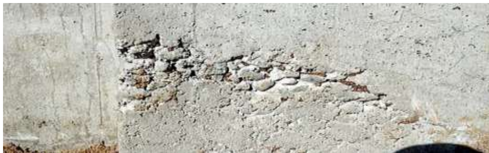
Figure 13. Honeycombs on concrete.