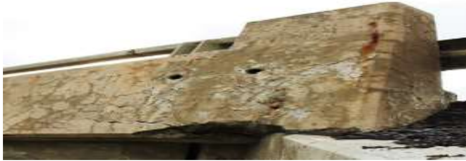
Figure 8. Disintegration or scaling of concrete.