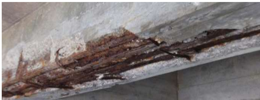
Figure 9. Corrosion of reinforcement.

of concrete at regular interval will help to ensure the safety and reliability of this critical national asset. Industrial application of NDT and related approaches will help in detecting and quantifying potential defects and deterioration mechanism at early stage of the structure. Analysts have posited that tests results from the application of NDT will help decision makers in prioritising repairs and maintenance schedules for their assets.